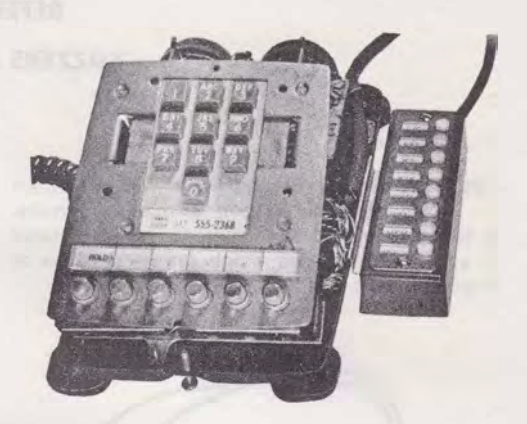
Fig. 4 - Typical Installation