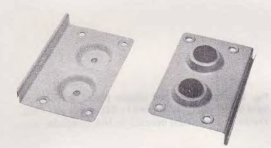
Fig. 1 - 75A Bracket, Top and Bottom Views

1.01 This section shows identification and installation information on the 75A, 76A, and 77A brackets.