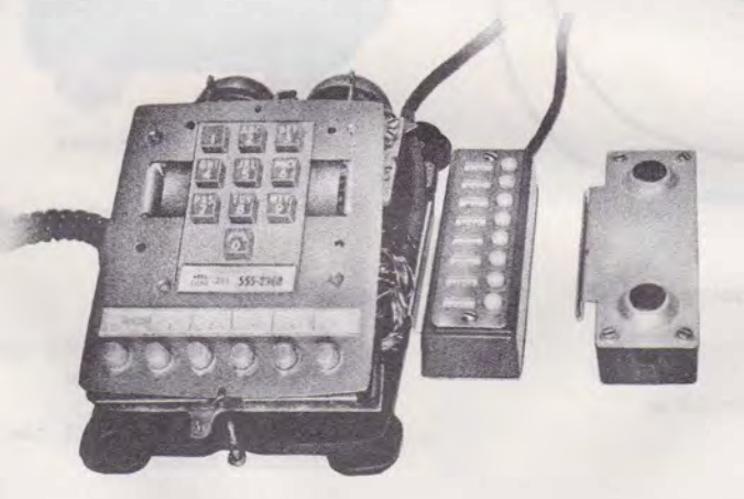
Fig. 5 - Typical Installation, Cover Removed