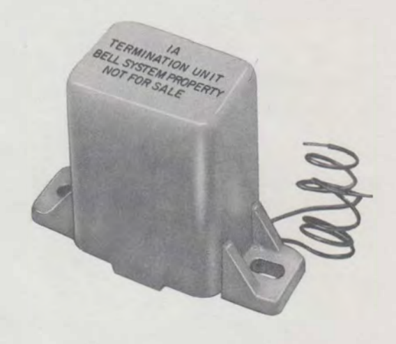
Fig. 1-1A Termination Unit