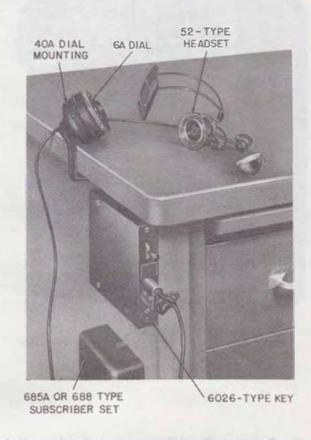
Fig. 1—Typical 4A Key Equipment Installation

2.03 See Table A for selection of components for the various configurations of the 4A key equipment.