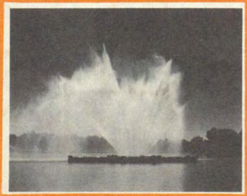
ELECTRICALLY LIGHTED FOUNTAIN DISPLAY—CITY PARK