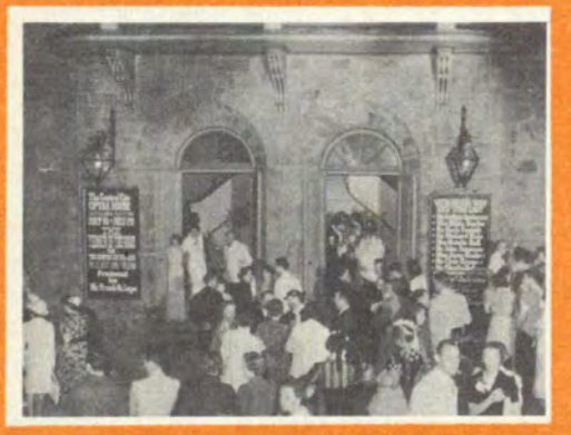
FAMOUS CENTRAL CITY OPERA HOUSE