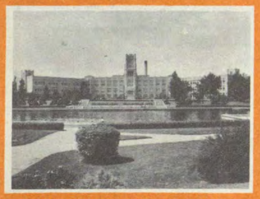
ONE OF DENVER'S FIVE HIGH SCHOOLS