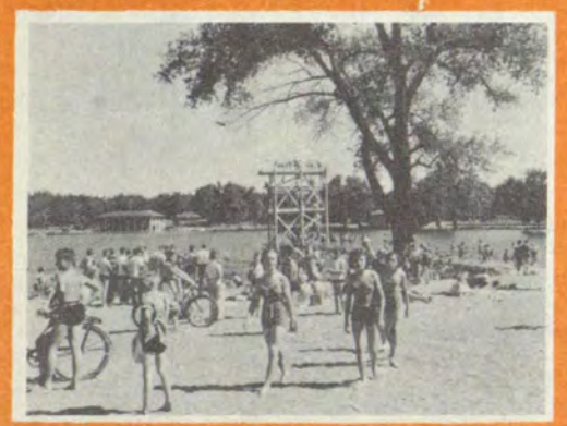
AT ONE OF DENVER'S CITY PARKS