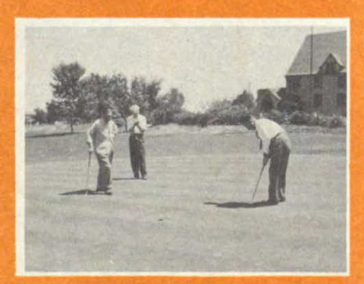
ONE OF DENVER'S MANY GOLF COURSES