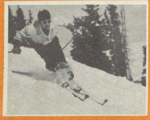
WINTER SPORTS IN DENVER MOUNTAIN